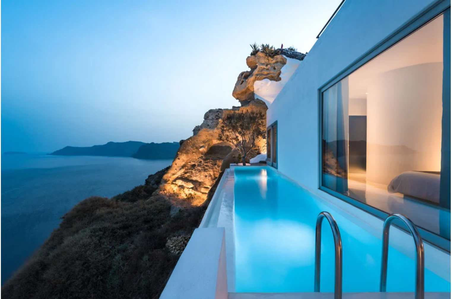
An exclusive suite at Adronis

Adronis Luxury Suites is a little further along the volcano rim, in the midst of the boutiques and galleries. Step off the street though and down the stairs to find suites like ours where the smooth varnished grey cement of the spacious bedroom spills out onto a terrace complete with a large hot tub, from where views of the caldera surround you. Lean over and you can see tables being set for dinner at Lycabettus ( https://www.lycabettusrestaurant.com ), the gourmet restaurant which juts out over the sea. Service is exemplary here – with taxis (not always easy to find, as there are only 39 on the island) always arriving in minutes and everything done with a smile.