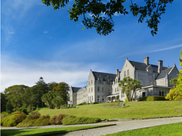
Save Place