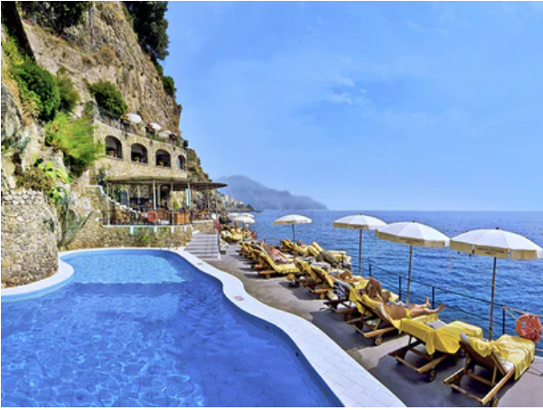
Photo courtesy of Hotel-Santa-Caterina , a member of The Leading Hotels of the World or Le Sirenuse Save Place