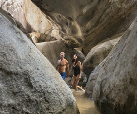
From Pristine Beaches to Verdant Hills, Connect with Nature in the British Virgin Islands