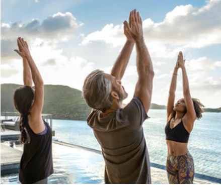
Celebrate With a Trip of a Lifetime in the British Virgin Islands' Luxe Villas