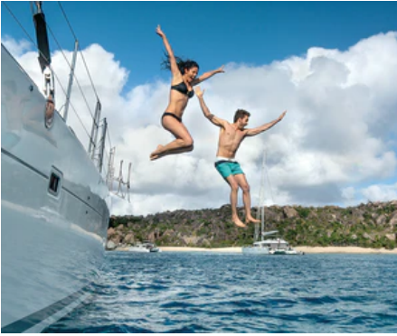
Discover the Romance of the British Virgin Islands on a Private Yacht