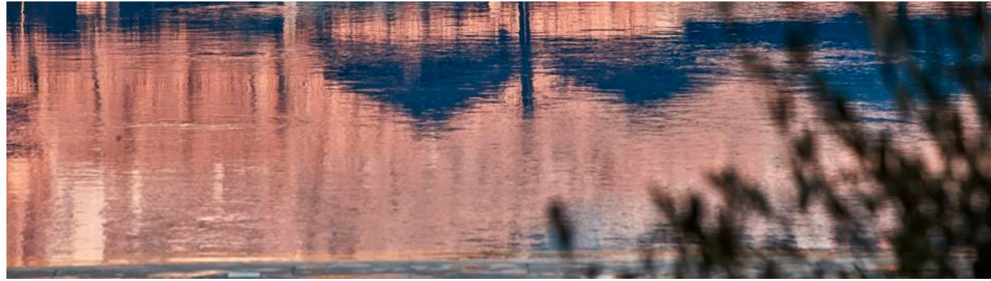
Mykonian Villa Collection.

Because of how successful they've been at implementing these safety protocols, the resorts were recently able to open their doors to many travel influencers, international celebrities and fashion entrepreneurs. The Blonde Abroad visited the Mykonian Villa Collection this summer, as did Kristallik Blue, Olesya Gevorkyan and Isabella Garofanelli.