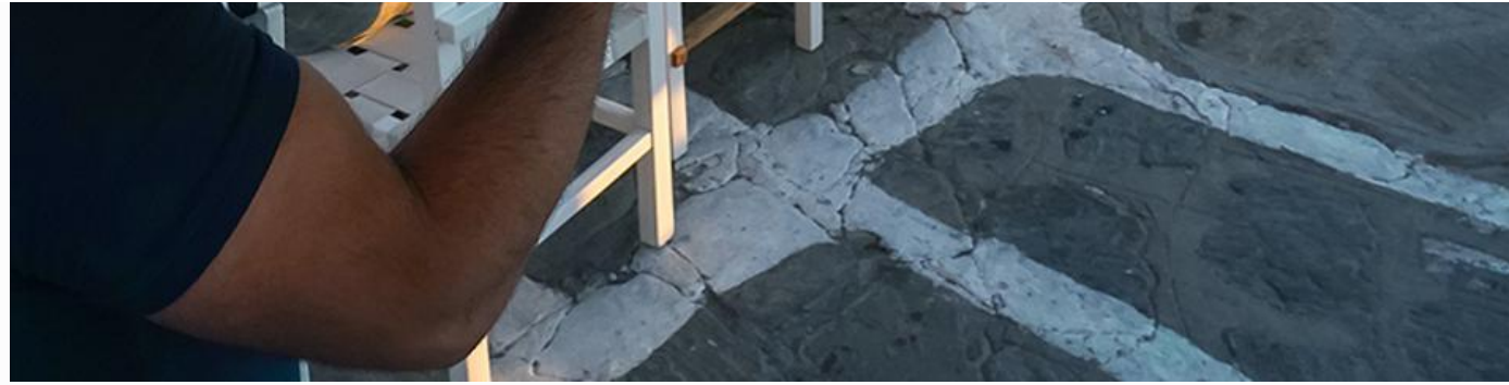
Nice n Easy, Mykonos.

The menu, like SantAnna's, is "healthy gourmet," and each dish is made with fresh, local, seasonal ingredients.