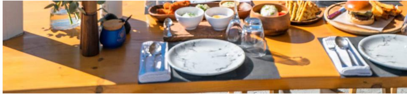
Pool restaurant at Bohème, Mykonos. BOHEME

Bohème's vibe is modern, stylish and vibrant. The hotel is a few steps away from the Mykonos' infamous windmills and the trendy Little Venice.