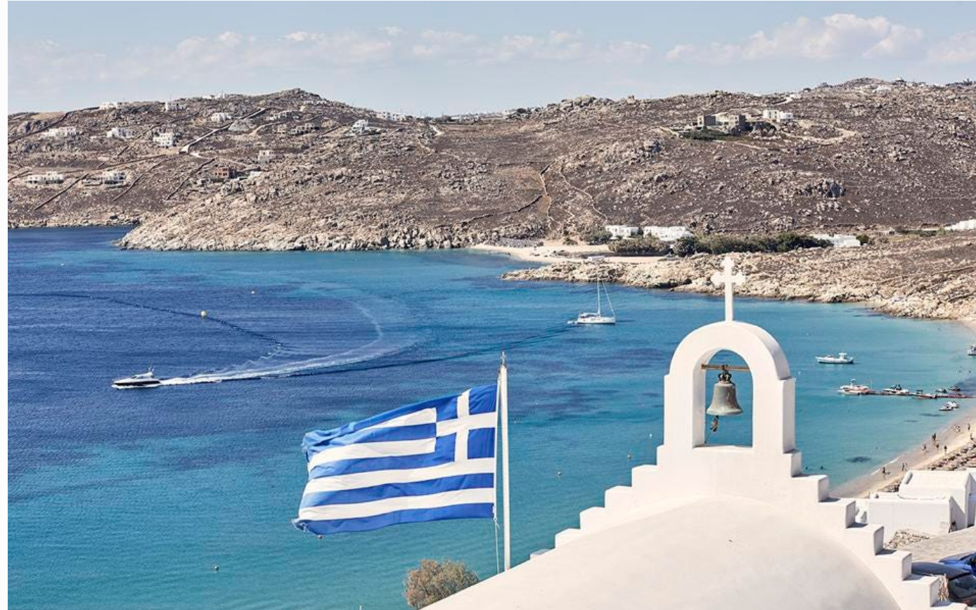
Myconian Villa Collection.

The Myconian Collection , the most regal villa and resort collection in all of Mykonos, worked throughout the pandemic to open up new locations all over the island—the Panoptis Escape, ideal for a relaxing retreat, being the latest. The other nine hotels in