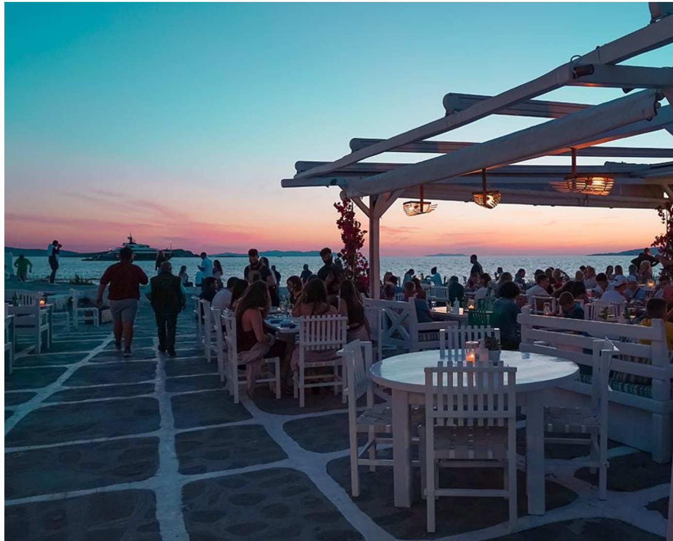
Nice n Easy, Mykonos.

The menu, like SantAnna's, is "healthy gourmet," and each dish is made with fresh, local, seasonal ingredients.