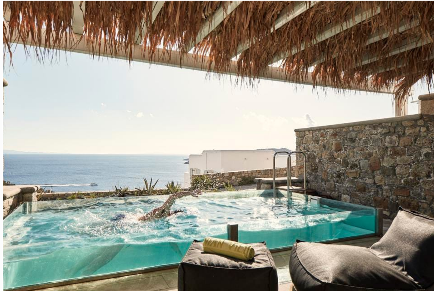
Myconian Villa Collection. MYCONIAN VILLA COLLECTION

the Collection are: Ambassador, Avaton, Imperial, Korali, Kyma, Naia, Royal Myconian, Utopia and the Myconian Villa Collection.