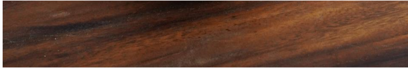
Fine dining at SantAnna beach club, Mykonos.

It also helps that the spot is entirely open and fresh due to the Mykonos breeze. This makes it easy for visitors to stay socially distanced even when they are eating or swimming without face masks.