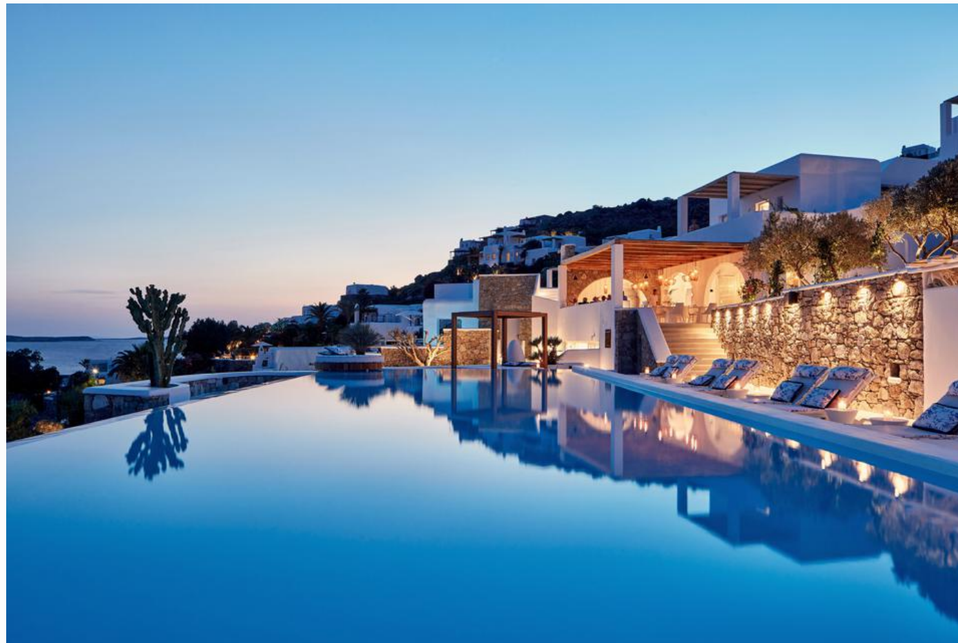
Katikies, Mykonos.

They also guarantee the ecological disinfection of every room and mattress, provided by PureSpace.