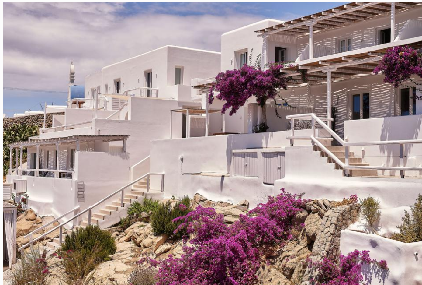
Bohème, Mykonos. BOHEME

But being near the nightlife scene of Mykonos town doesn't affect the hotel's serene seaside vibe—in fact, it's the best of both worlds for travelers. After a day of shopping, eating and exploring the town, visitors can retreat to their luxury suites, complete with private balconies and jacuzzis.