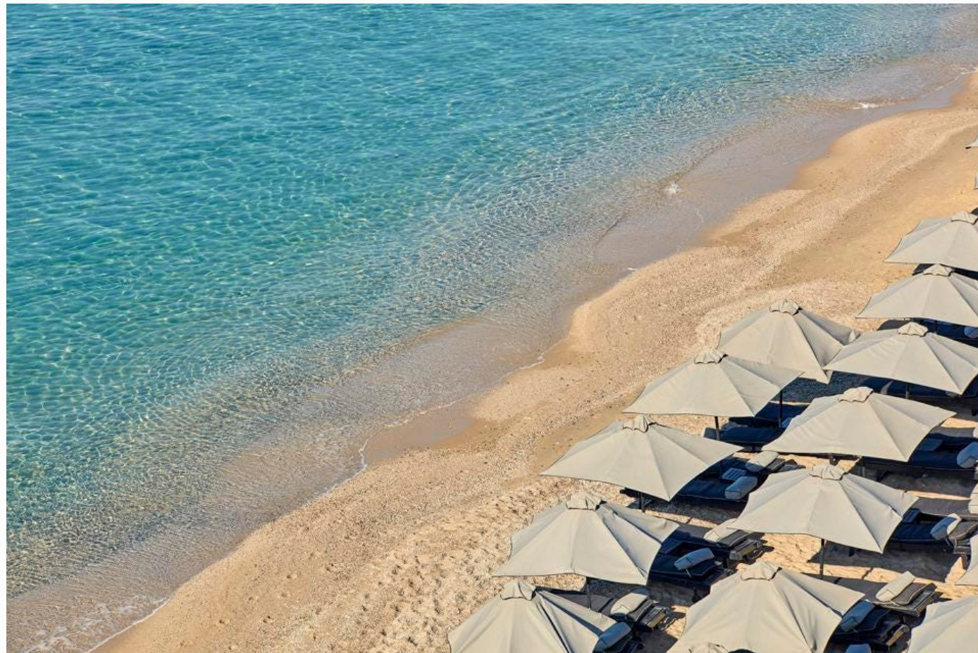
Mykonian Villa Collection.

Because of how successful they've been at implementing these safety protocols, the resorts were recently able to open their doors to many travel influencers, international celebrities and fashion entrepreneurs. The Blonde Abroad visited the Mykonian Villa Collection this summer, as did Kristallik Blue, Olesya Gevorkyan and Isabella Garofanelli.