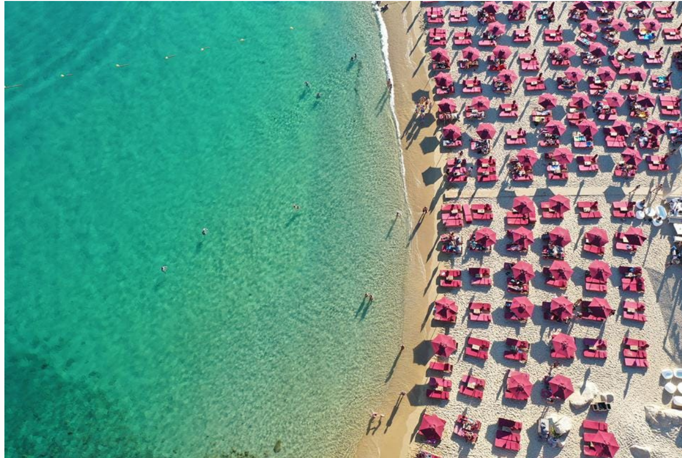
Super Paradise Beach Club, Mykonos. SUPER PARADISE BEACH CLUB

If you're looking for a coronavirus-safe summer party, Super Paradise Beach Club is the place to be. Not only can visitors enjoy a day of tanning and day drinking on the shimmering, white beach, they can also sit down for a five-course meal at the club's restaurant—where Greek rosé flows like water.