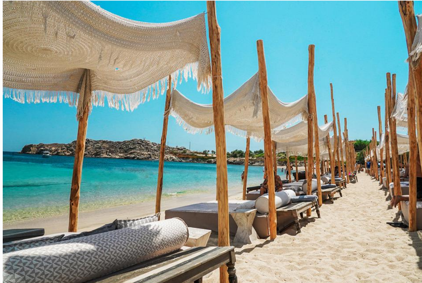
Beach cabanas in SantAnna beach club, Mykonos.