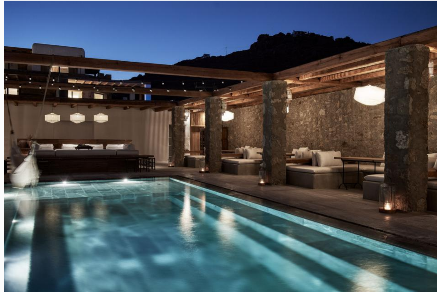
Pool at Nomad, Mykonos. NOMAD

Every piece of decoration in the hotel is handpicked, and the architecture is simple yet refined. The smooth, earthy, grey tones throughout create a soothing atmosphere, which is echoed by the tranquil mountainous landscape the hotel is built on.