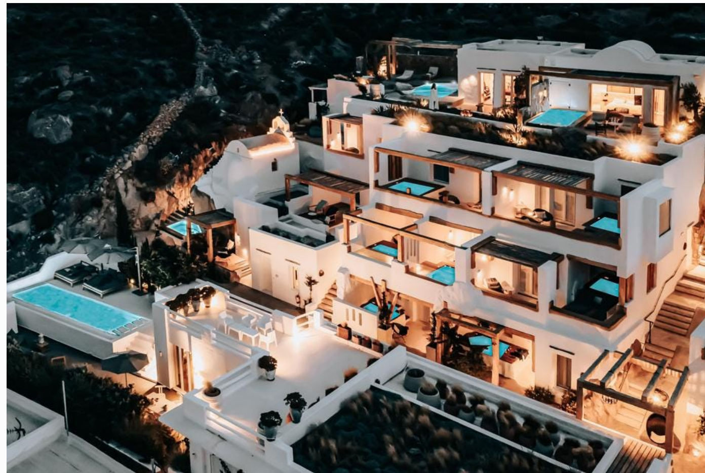
Kenshō Psarou, Mykonos. KENSHŌ PSAROU