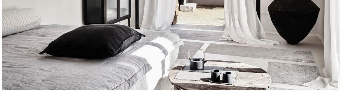
Suite in Nomad, Mykonos. NOMAD

Both Bohème and Nomad have applied the "Health First" Greek certified action plan to fight COVID-19, and all rooms and facilities are disinfected using PureSpace and Diversey products.