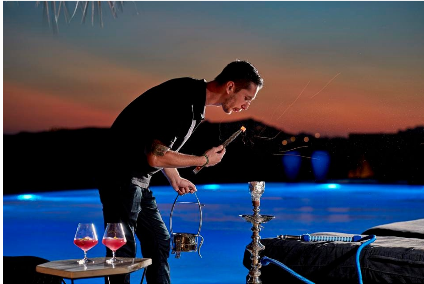
Myconian Villa Collection.

To keep visitors safe during the ongoing global health crisis, the hoteliers have made sure their staff members are always wearing face coverings and are regularly tested for COVID-19. The hotel's 5-star restaurants, common areas and suites—including the private villas—are routinely sanitized, and guests are offered antibacterial gel, hand wipes and face coverings daily. A negative COVID-19 test or vaccination card is also required to stay at any of the Collection hotels.